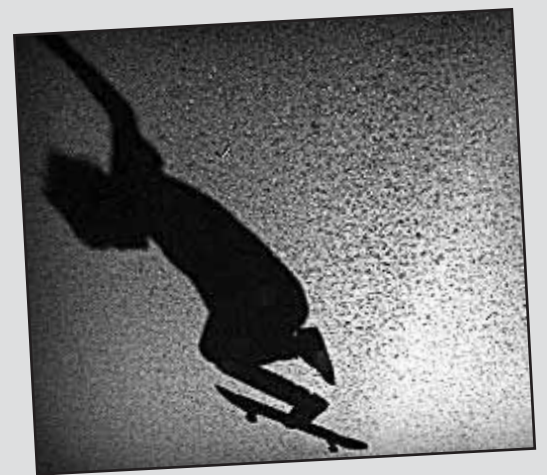
LINDSAY MALONE "skateboarder" (featured on Blue Bubblegum)