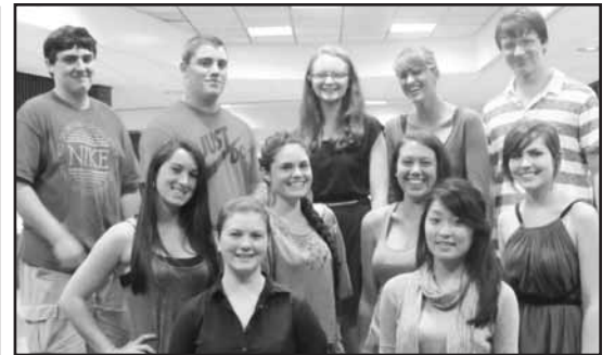
The All-County musicians will perform at the NYSCAME All-County Conference at Huntington High School in November.

Eleven of the District's top student-musicians have been selected to perform at the New York State Council of Administrators of Music Education (NYSCAME) All-County Conference in November at Huntington High School. These young musicians were selected from a large pool of Suffolk County student-musicians and were considered for this prestigious opportunity based on their New York State School Music Association (NYSSMA) scores and teacher recommendations. They include: