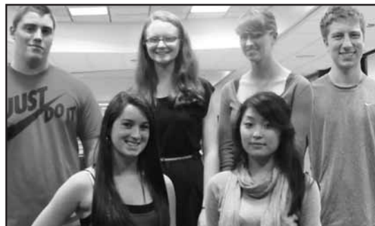
The All-State musicians will participate in the NYSSMA Conference in Rochester this December.